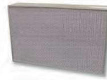
8. Gigapleat Panel