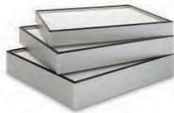
7. Megalum FabSafe