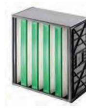
4. Absolute VG