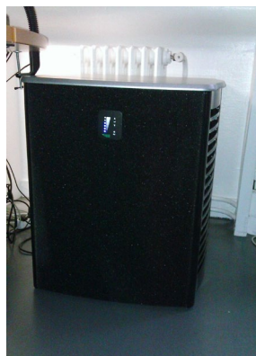
CamCleaner City installed in an office